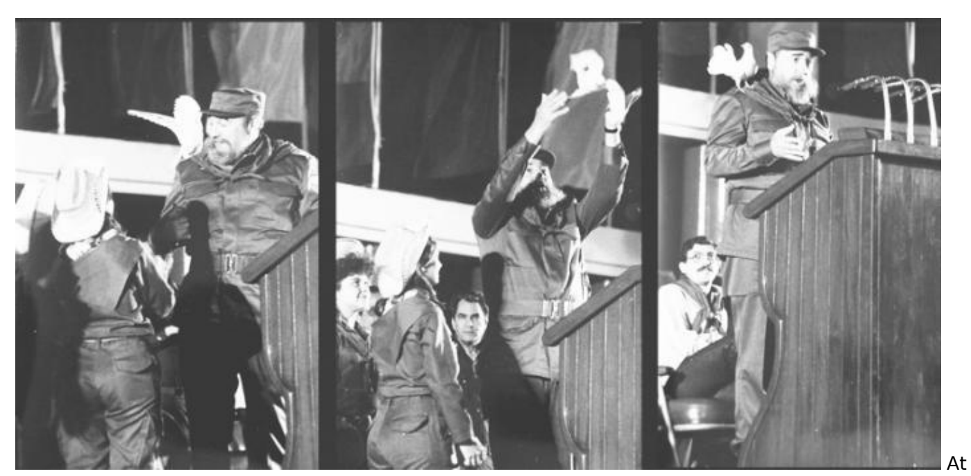
the Ciudad Libertad educational complex, 30 years after that symbolic January 8.